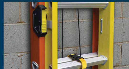
Dual locking system