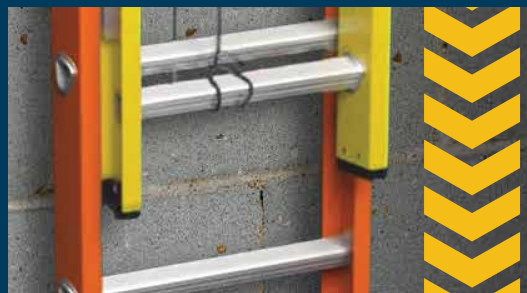
Lowering assist controls descent