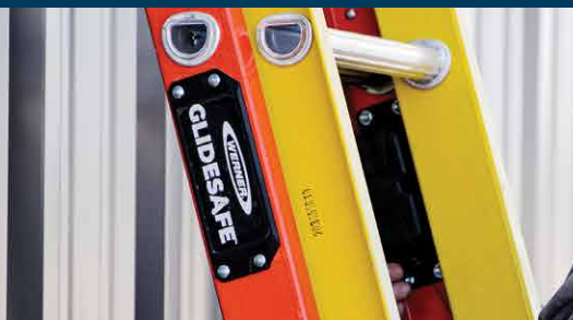
Lift assist technology reduces strain