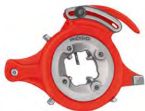
No. 711 & No. 914