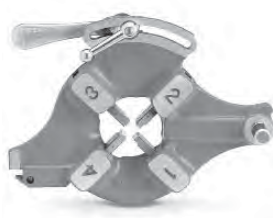
No. 713 & No. 913