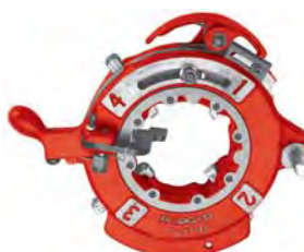
No. 714 & No. 914