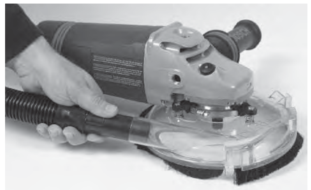
5. Insert hose to port. Secure other end of hose to the electric cord with releasable tie provided.

Go to www.dustlesstechnologies.com for more installation videos and tips