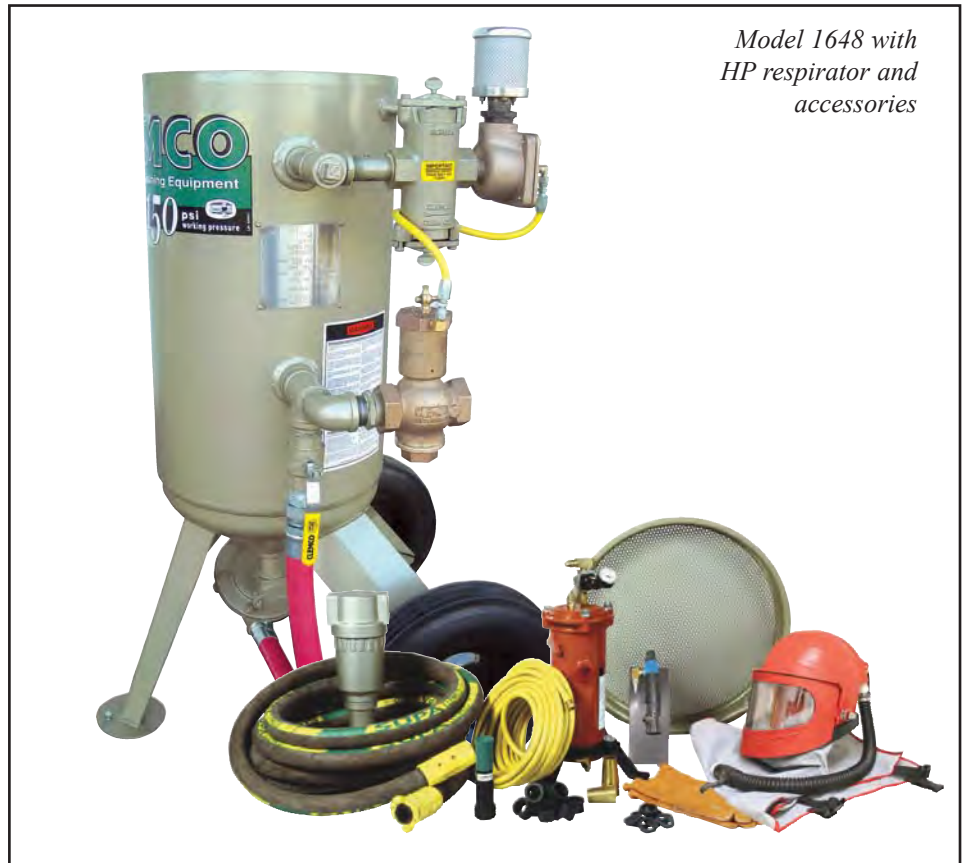
Model 1648 with HP respirator and accessories