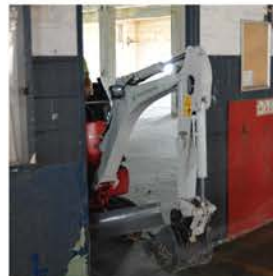
RETRACTABLE UNDERCARRIAGE AND BLADE