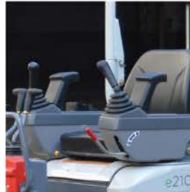
DUAL SIDE ENTRY