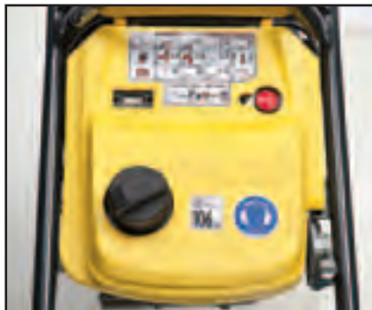
Easy to access controls.