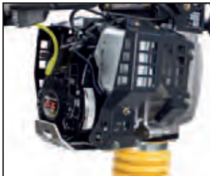
All around engine protection.