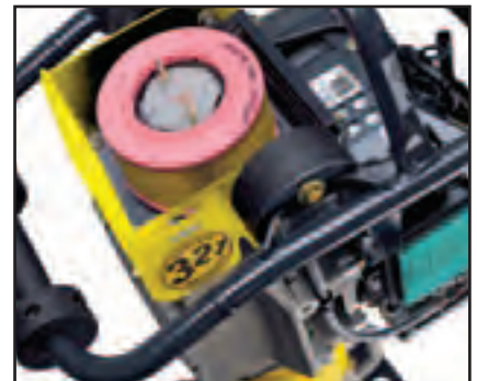
Dual air filter system helps extend the life of the engine.