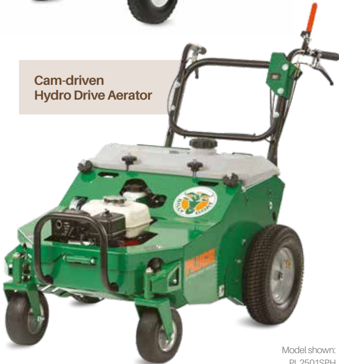
Model shown: PL2501SPH