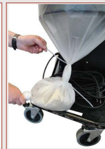
Attach two ties with a 5" gap