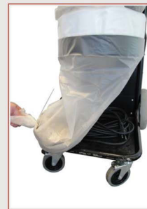
Pull the bag down.