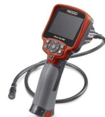
micro CA-300 Inspection Camera Catalog No. 37888