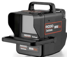
MINIPak Monitor Catalog No. 32748