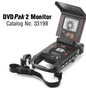
DVD Pak 2 Monitor Catalog No. 33198