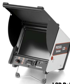
LCD Pak Monitor Catalog No. 37843