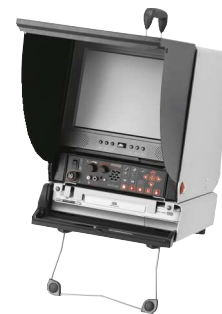
All Larger SeeSnake® CCUs