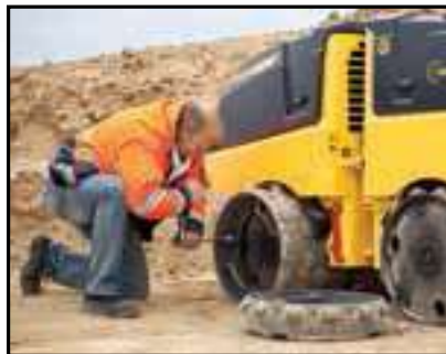
Easy installation of standard bolt-on drum extensions increases compactor versatility.