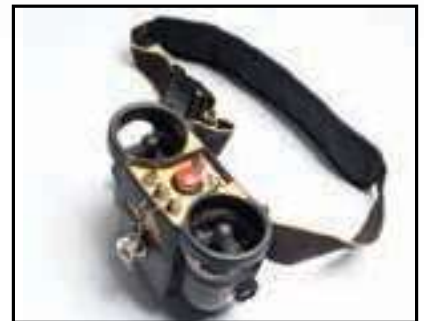
Light weight, dual function cable / radio remote control is easy and safe to operate.