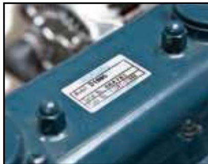
Water cooled Kubota engine with ECOMODE (Fuel Saver).