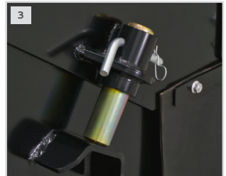
3. PIN ADJUSTMENT SYSTEM TO QUICKLY SET BRISTLE HEIGHT