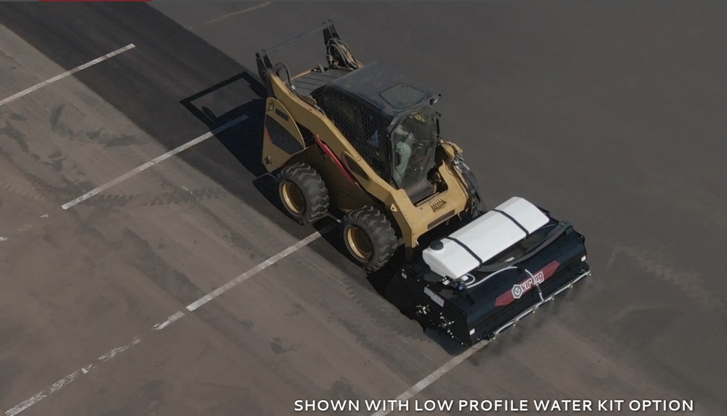
SHOWN WITH LOW PROFILE WATER KIT OPTION