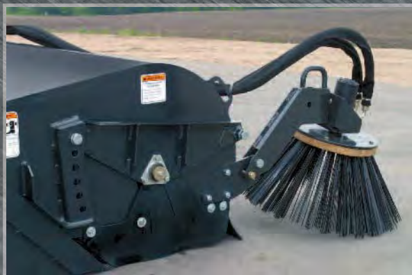
Shown with optional Curb Sweeper for getting closer to curbs, buildings or other objects.

Sweep clean, scrape mud going forward or in reverse. Ideal for construction, industrial or municipal jobs, the Clean Sweep Pick-Up Broom is easy to attach and simple to operate. The reversible cutting edge helps cut loose caked-on mud, while the sweeper's poly bristles deposit dirt and debris in the container which can be dumped when full.