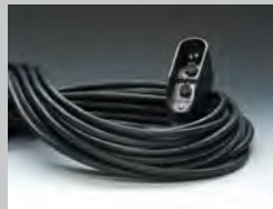
150' Remote Cord