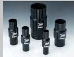
Hose Swivels 2-6" Available