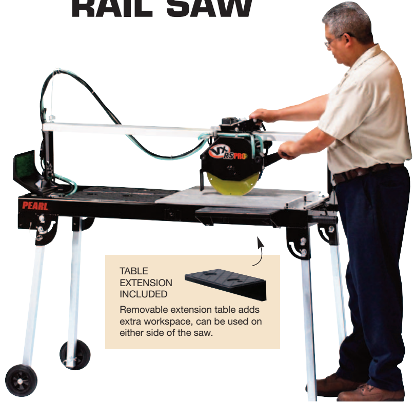
TABLE EXTENSION INCLUDED

Removable extension table adds extra workspace, can be used on either side of the saw.