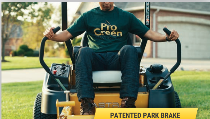
PATENTED PARK BRAKE

Simple, convenient, system that automatically disengages/engages the parking brake when you close/open the steering levers. No extra park brake lever to worry about.