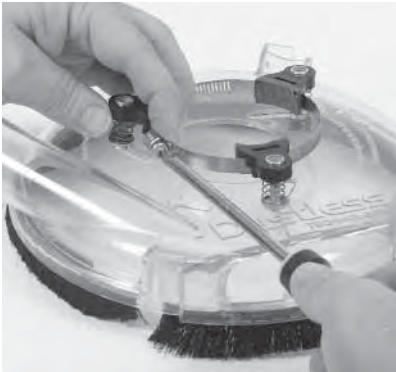
1. Loosen band clamp.