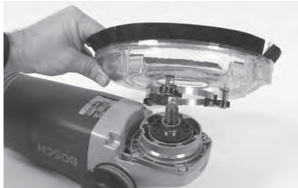
2. Slip around grinder's collar.