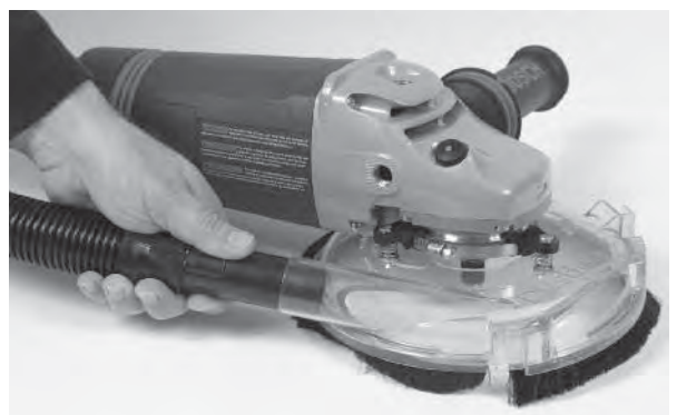
5. Insert hose to port. Secure other end of hose to the electric cord with releasable tie provided.

Go to www.dustlesstechnologies.com for more installation videos and tips