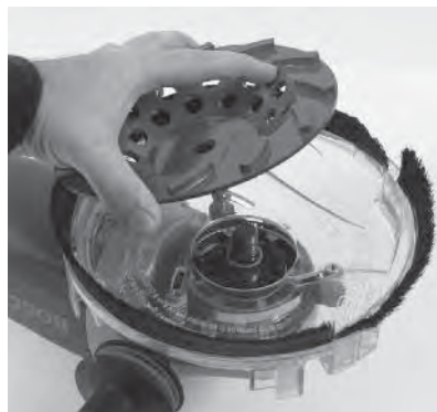
4. Install grinding wheel. (Use the washers provided to adjust wheel slightly below the brushes. You may also adjust the 3 screws if needed)