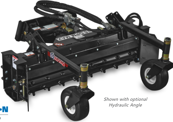
Shown with optional Hydraulic Angle