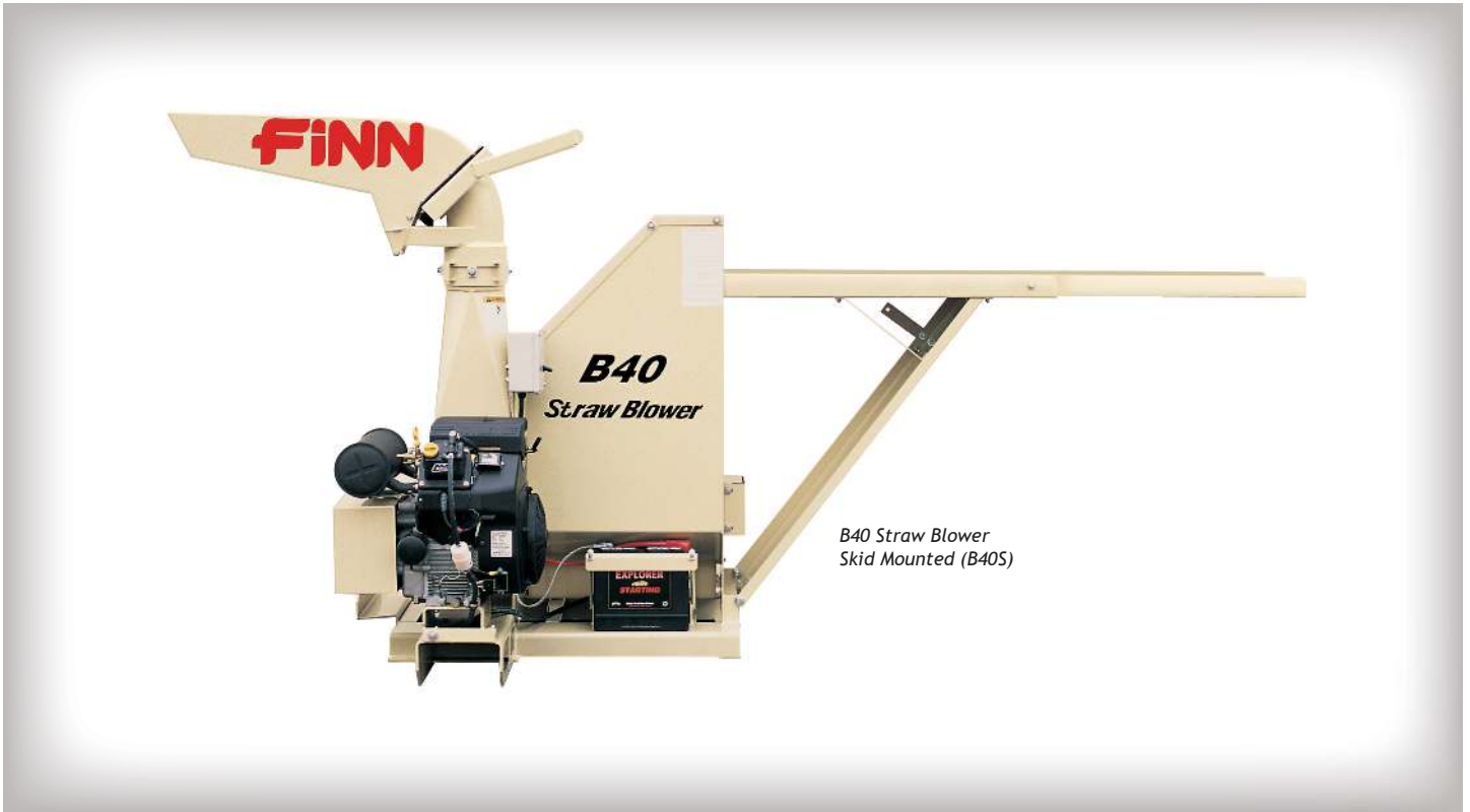
B40 Straw Blower Skid Mounted (B40S)

The FINN B40 Straw Blower brings mulching ease to small landscaping operations. You save time and energy by eliminating tedious and time consuming hand mulching. And because the unit is both self-powered and portable, it's easy for you to mulch in diverse locations.