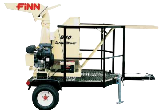
B40 Straw Blower Trailer Mounted (B40T)

As the world leader for over 80 years in the design and manufacture of innovative, quality equipment for the erosion control industry, FINN Corporation is committed to your complete satisfaction.