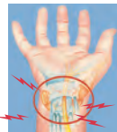
Carpal tunnel syndrome

Just pull the trigger, this simple operation reduces potential wrist damage such as carpal tunnel injuries.