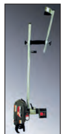
Extension bar (JE200)