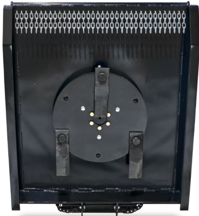
DETAIL UNDER DECK