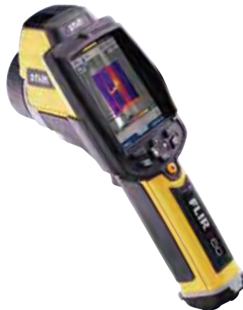
The "b" Series Infrared Camera helps speed up diagnostic work, especially when used with a Blower Door.