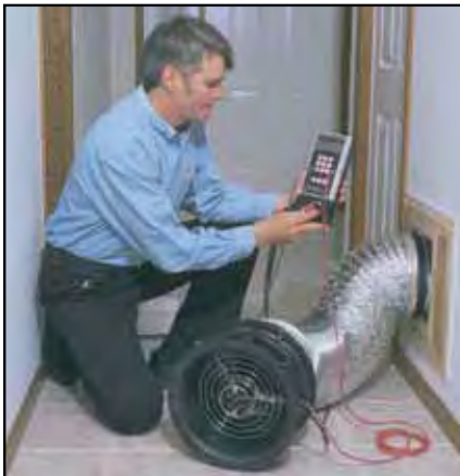
The Minneapolis Duct Blaster® is used to measure the airtightness of duct work.

Other building diagnostic products available from The Energy Conservatory