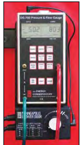
DG-700 Pressure and Flow Gauge with Cruise feature