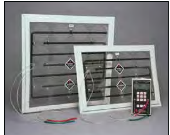
The TrueFlow® Air Handler Flow Meter, shown with DG-700, is used to measure the total amount of air moving through an air handler.