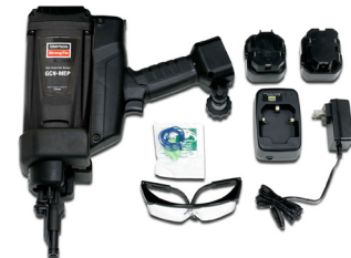
GCN-MEPKT or GCN-MEPMAGKT (with magazine)