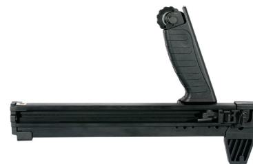
MEP-MAG1KT sold separately