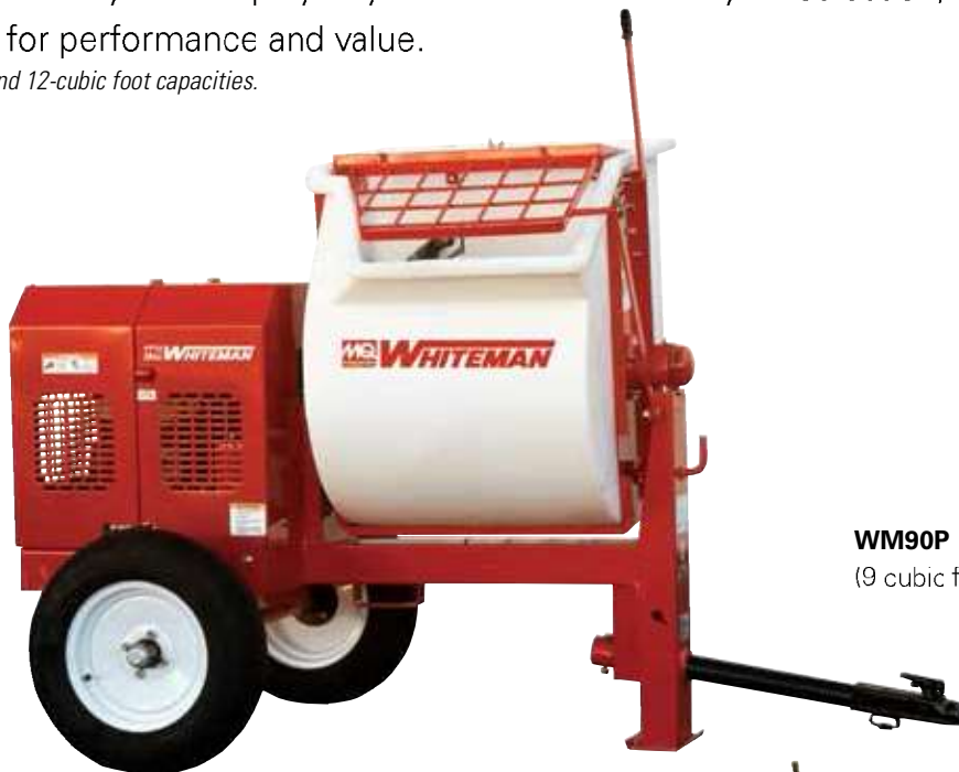
WM90P (9 cubic ft., Poly drum)

Models available in 7-, 9-, and 12-cubic foot capacities.