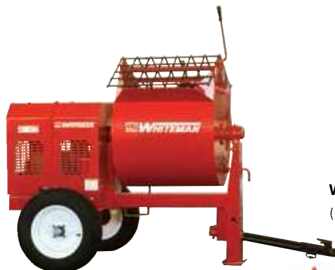
WM90S (9 cubic ft., Steel drum)