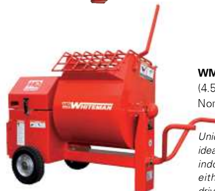
WM45 (4.5 cubic ft., Steel drum) Non-towable

Unique wheelbarrow design ideal for small batch jobs and indoor work. Available with either electric or gasoline drive.