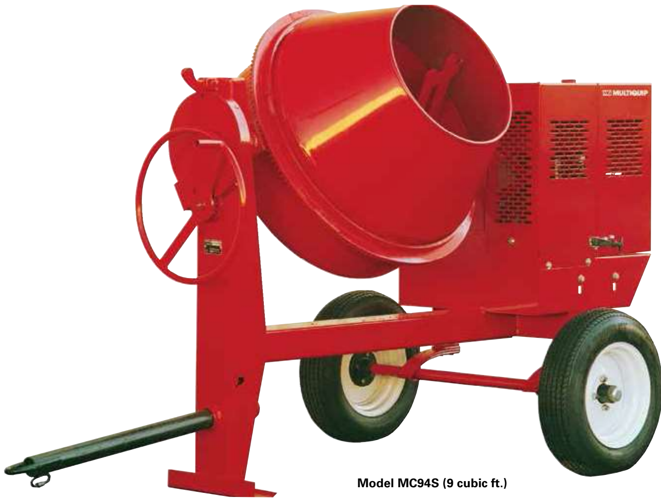
Model MC94S (9 cubic ft.)

Multiquip concrete mixers are available with either steel or polyethylene drums. Their durable construction and low maintenance requirements will provide you with years of reliable service.