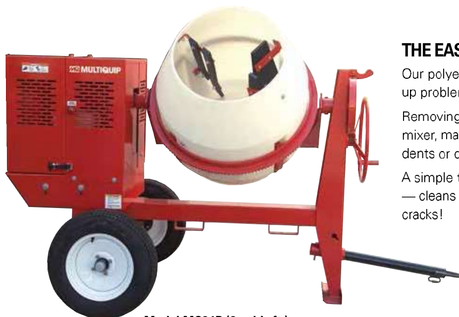
Model MC94P (9 cubic ft.)

...but not with an EasyClean mixer! A few taps with a rubber mallet and the dried concrete falls right out!