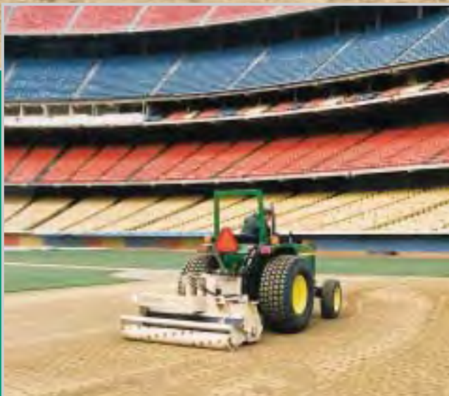
Model 605 renovating a baseball stadium.