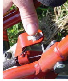
3 Flip kill switch to "ON" position.