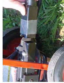
2 Snap torque tube onto connector at engine end.