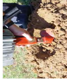
9 For greater depths, un-snap auger from transmission.