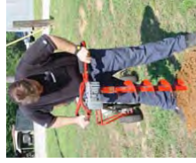
11 Continue digging with auger and extension.