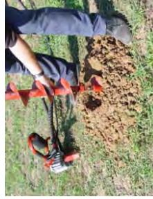
10 Snap extension to auger.