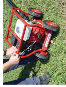
4 Starting position: pull starter rope.