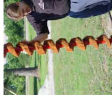
12 Remove handle, then move auger and extension from hole.

For Further Inquires Call: 1-800-227-7515