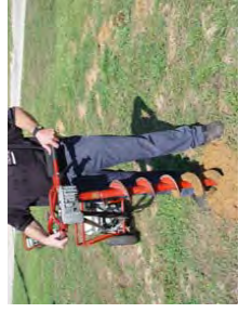
8 When hole is complete stop auger and pull out for clean hole.