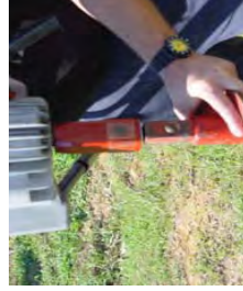
5 Attach auger to transmission adaptor.