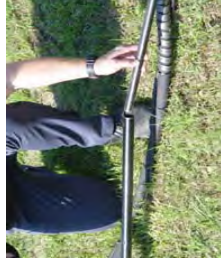
1 Slide round end of torque tube onto torque bar attached to handle.