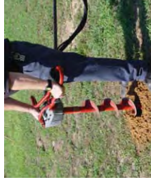
7 For safety, always keep leg pad against leg while digging.