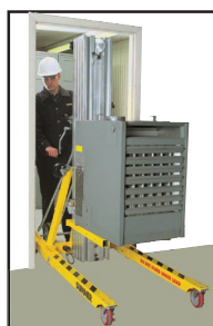
Fits through doorways!

Hard tread urethane wheels with Delrin® bearings.