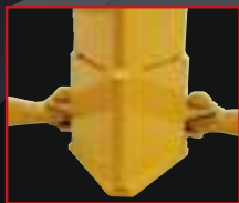
Heavy duty Frame Base and Center Leg stand up to heavy use.