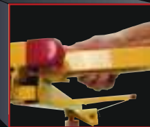
Easy action Cross Arm release simplifies and speeds disassembly.