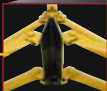
Jam resistant Tripod Base simplifies assembly / disassembly.

We improved the design of the PANELLIFT® DRYWALL LIFTERS. The upgrades are reflected in the pictures below. The upgrades reflect our greatest effort to improve our products to meet customer expectations and exceed the industry standards.