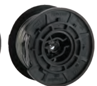
19 ga. Buy American Wire

TW1061T-S- STAINLESS STEEL WIRE IS ALSO AVAILABLE AS A SPECIAL ORDER ITEM.