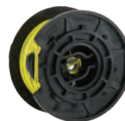
19 ga. Poly Coated Wire