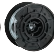
19 ga. Electro. Galvanized Wire