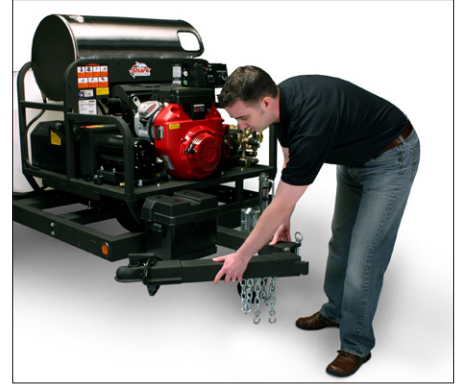
3. Maneuver trailer hitch to desired position, and put tethered pin back in place.