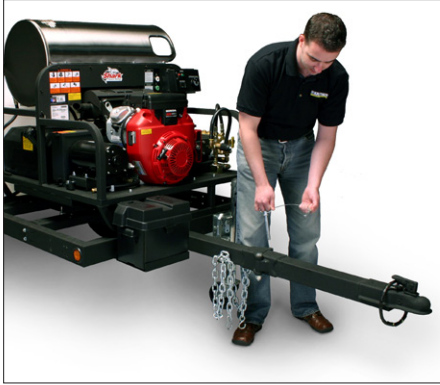
1. Pull the pin out of the tongue hinge.

39-inch tongue with swing-away hinge makes it easy as 1-2-3 to save on storage space.