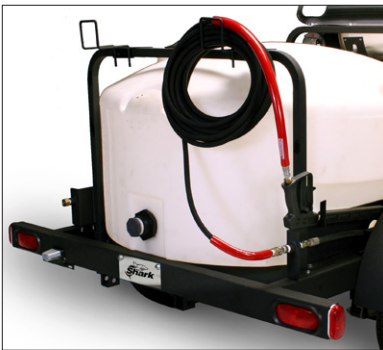
Lighted license plate holder and recessed tail lights.