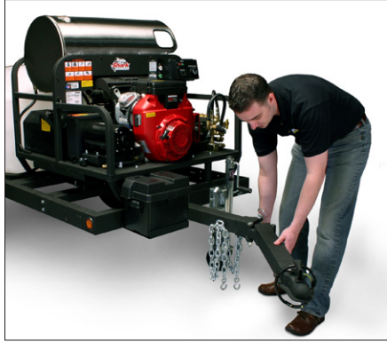
2. Push trailer hitch to the side.