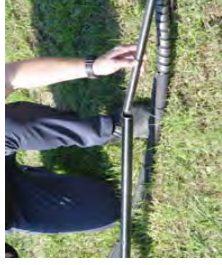
1 Slide round end of torque tube onto torque bar attached to handle.