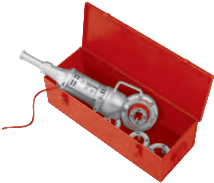
Shown With Optional Case