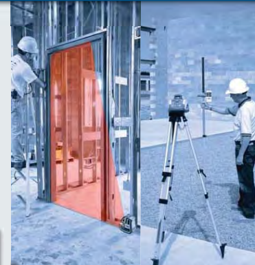
Construction Productivity Tools

Toughest on Earth Strongest Warranty Easiest to Use