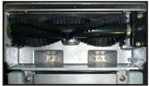
Heavy Duty Cast Aluminum Vacuum Nozzle and Brush Housing with Powerful Chevron Brush