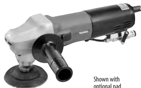
Shown with optional pad