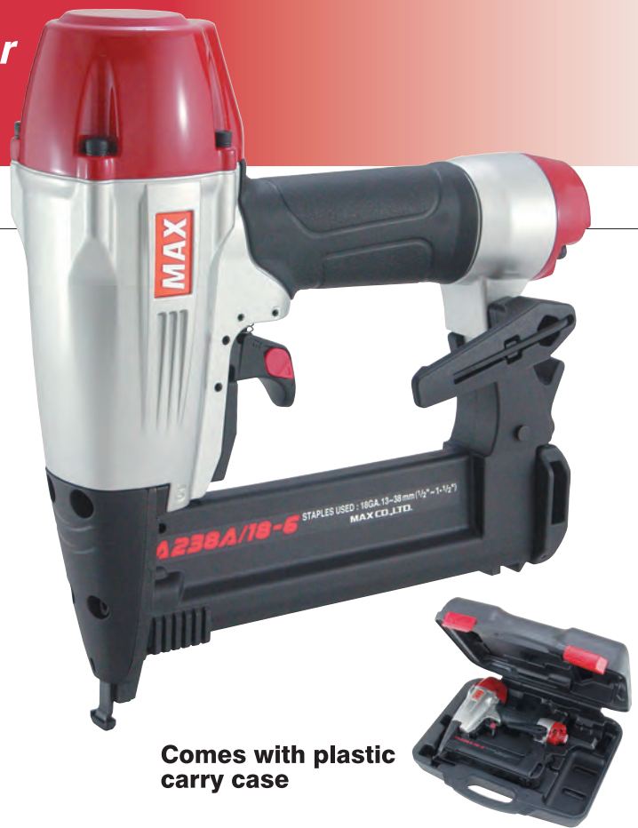
Comes with plastic carry case